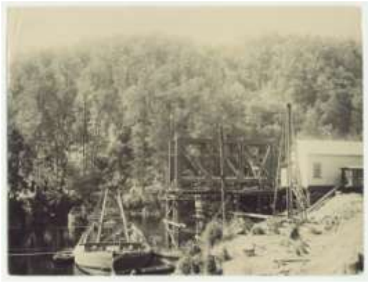
Figure 11 Launching of Iron Bridge from Teepookana yard viewed from D/S